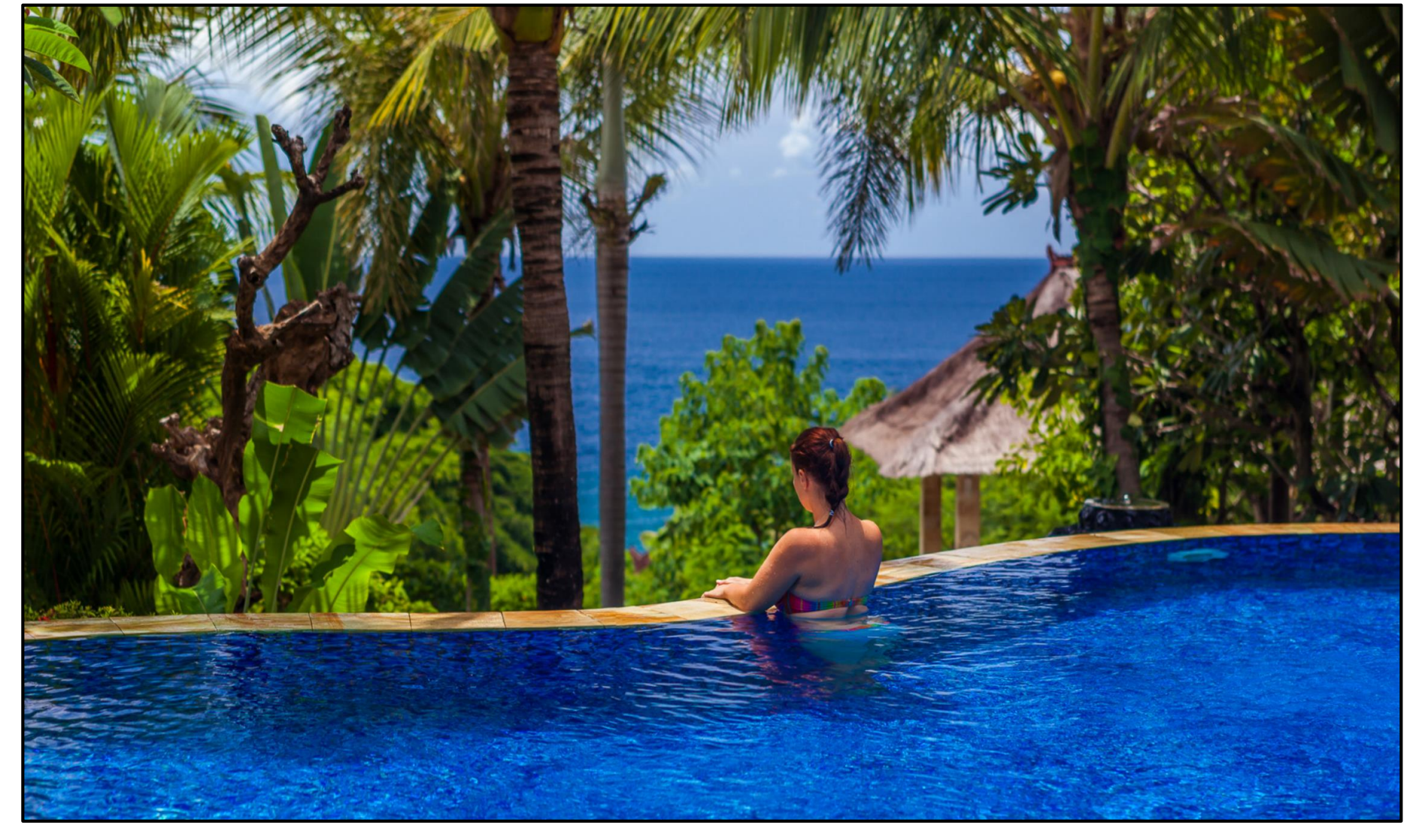
Only a two minute walk to the beach!!