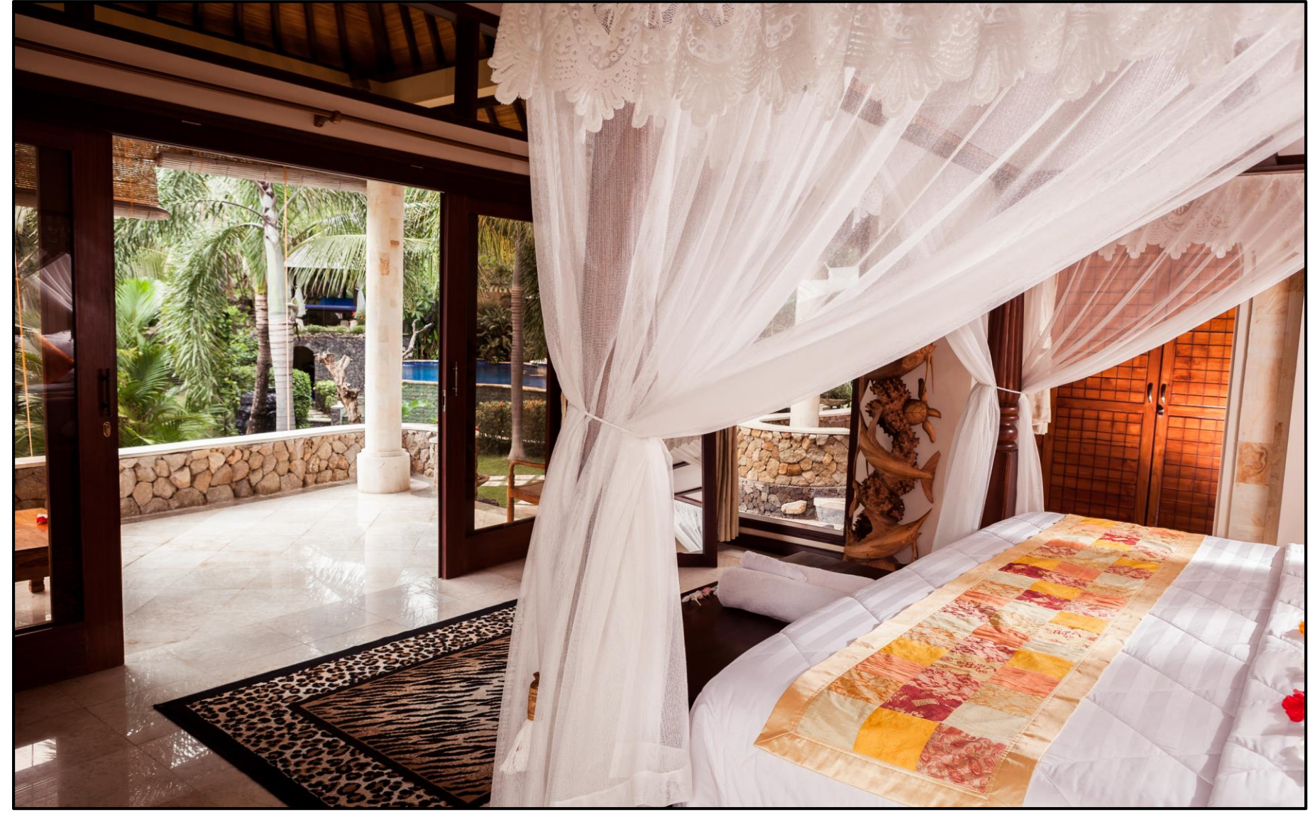
The property features a private pool, full kitchen, wiFi and satellite TV.